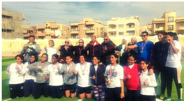
U18 Girls Football Winners

They are all great role models for our future teams.